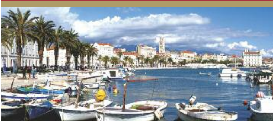
Split Promenade & Harbor