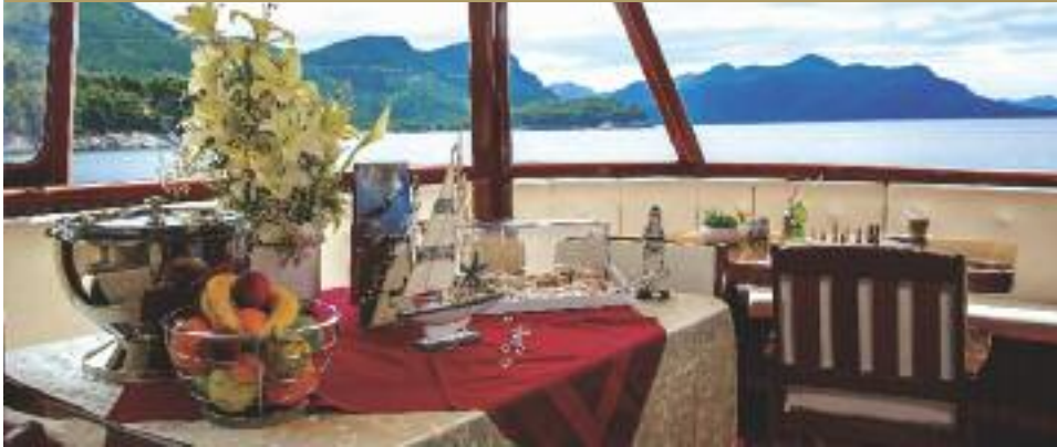
Breakfast beside the Scenic Adriatic Coast