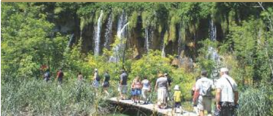
Plitvice Lakes National Park