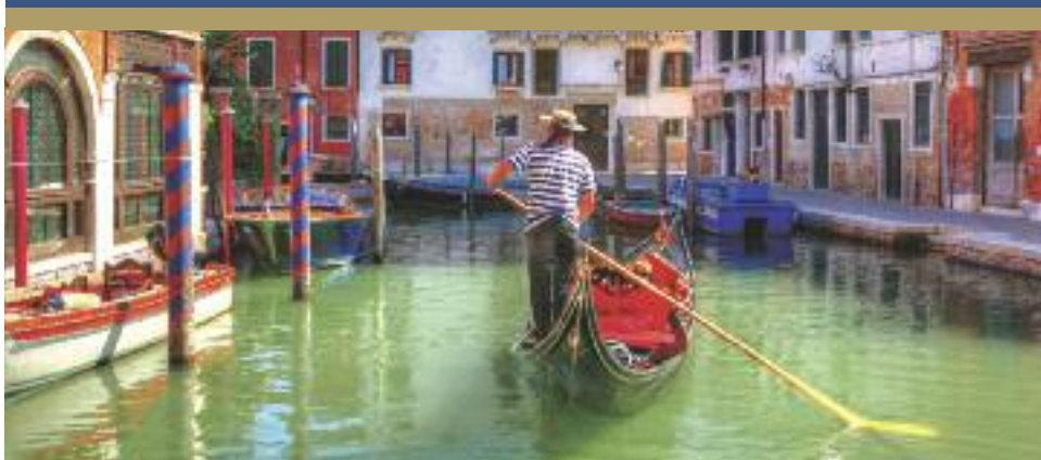
Gondola Ride in Venice