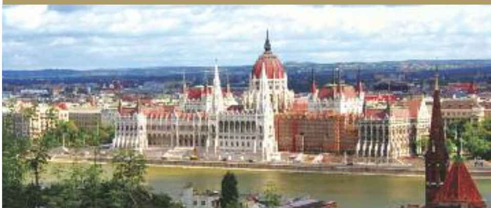
Parliament Buildings, Budapest